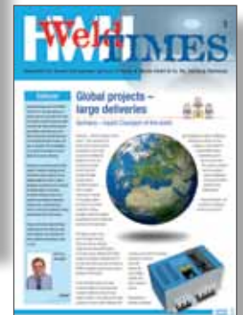
5 th issue September 2012