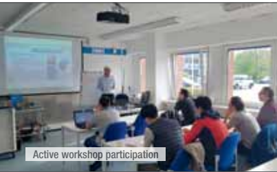
Active workshop participation