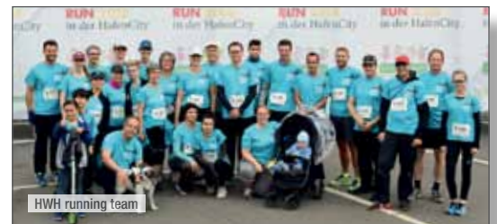
HWH running team

a dog is joining our team and has fun. Hence it's not so simple to calculate the number of runners in our team just by counting the legs and divide by two, we have also members on four legs. We are proud to be part of this run and to give to others who deserve it is also a moment to think about how good we all have it every