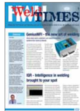
1 st issue September 2008

Our international sales and service network has been grown over the years giving you, our customers, the support you are asking for and deserve.